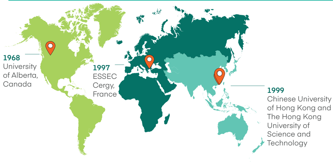
Initial expansion of AACSB accreditation across EMEA and Asia Pacific.

In 2001, AACSB changed its name to AACSB International: The Association to Advance Collegiate Schools of Business to signal the organization's commitment to business education globally.