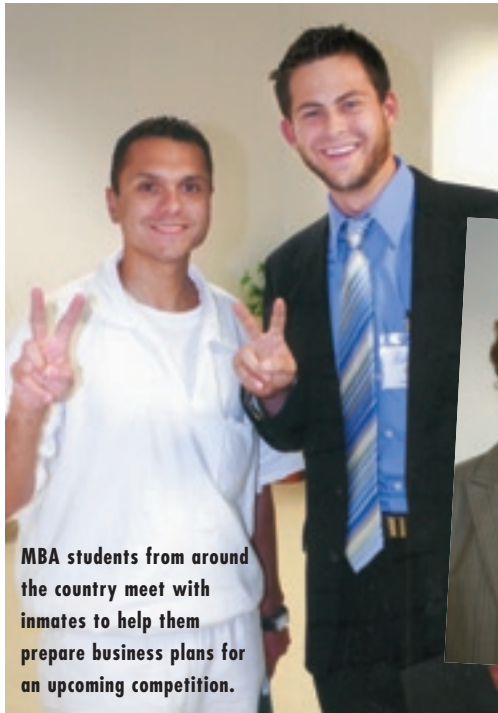
MBA students from around the country meet with inmates to help them prepare business plans for an upcoming competition.