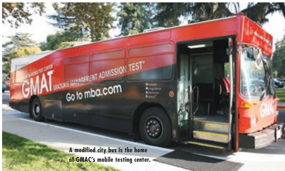
A modified city bus is the home of GMAC's mobile testing center.