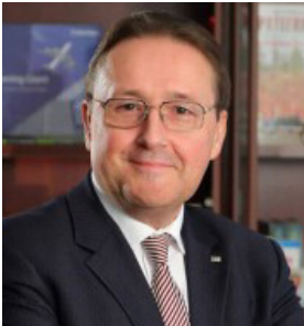
Sergey Myasoedov Institute of Business Studies (IBS-Moscow)